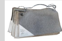
JT Standard Ring