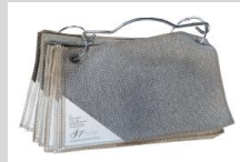
JT Standard Ring