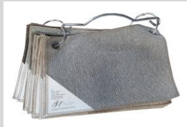
JT Standard Ring